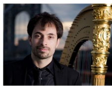
Sivan Magen Israeli harpist