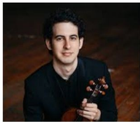
Itamar Zorman Israeli violinist

Sunday, March 2 at 3 PM Temple Beth Zion 805 Delaware Avenue