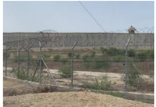
A guard tower on the border wall at Gaza. It looks and feels quite a bit different from the US border with Canada!