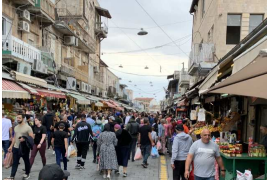
Markets in Jerusalem, alive with people buying challah in preparation for Shabbat.

Just after the High Holy Days, I joined the Buffalo Israel Experience group for my first trip to Israel. What an incredible journey it was! Over the course of 9 days we crisscrossed the country, exploring historic and modern sites in and around Jerusalem, Haifa, and Tel Aviv.