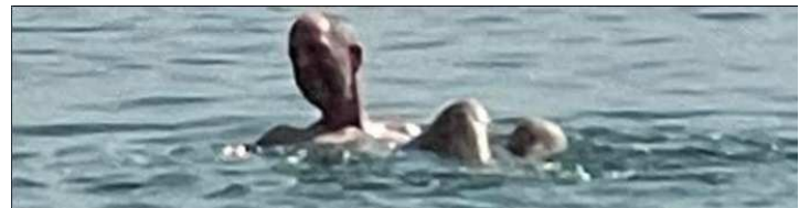
Floating in the Dead Sea, the lowest point on earth and nearly 10 times saltier than ocean water.

I am grateful to the Buffalo Jewish Federation for arranging the incredible trip and encourage everyone in our community to consider participating in future opportunities. Federation did a phenomenal job coordinating all of the arrangements, from our travel and hotel accommodations to meals, tours, and entertainment. It was fun, educational, and deeply meaningful, and I highly, highly recommend it.