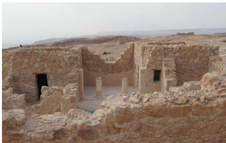
At the very top of Mt. Masada where a group of Jews fled to avoid persecution from the Romans.