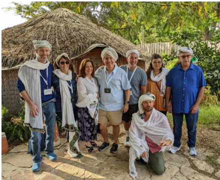
We met with a representative of Ethiopian Jews who made aliya with her family and shared her story and her culture, then dressed us in traditional Ethiopian attire.