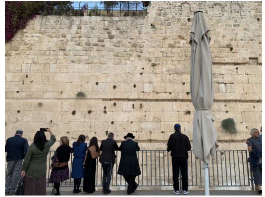
The egalitarian side of the Western Wall where men and women can worship together.