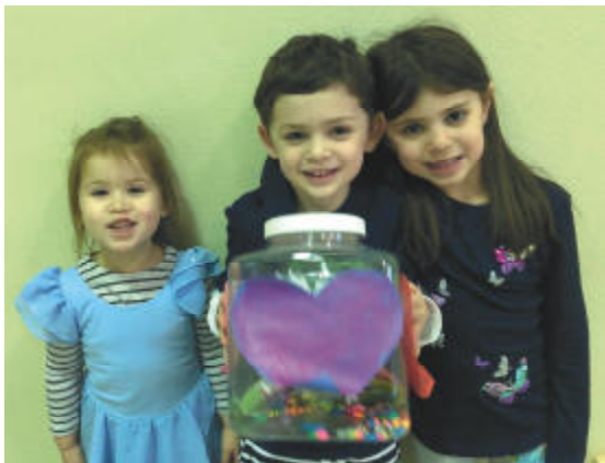
PALS-Kadimah students and their Jar of Hearts.