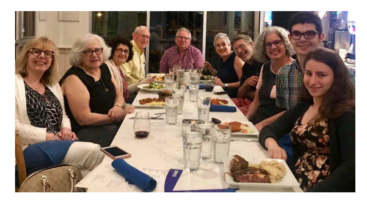
Members of our Temple Beth Zion family, and our Western New York Jewish community, are continuing to get together and form relationships through shared meals and activities. On May 29, Bagel Jay's was the meeting place for Bagel Breakfast. Panos welcomed the Shabbat Dinner Club on June 7. Details on future events hosted by the Engagement Committee are on page 5. All members of the community are welcome.