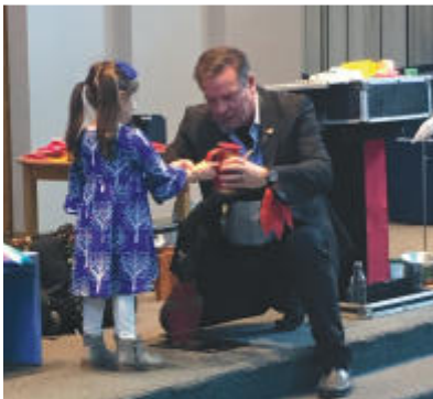
There were all sorts of fun things to do at the Family Chanukah Party, including a special magic show. The day was fun for children and adults!