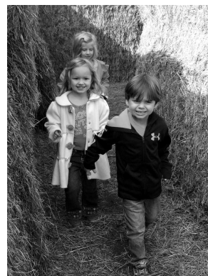
The hay maze was fun!