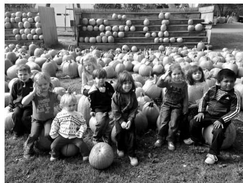
PALS at the Pumpkin Farm.

The year is off to an amazing start, and we look forward to spending each day with these smart, caring and energetic children.