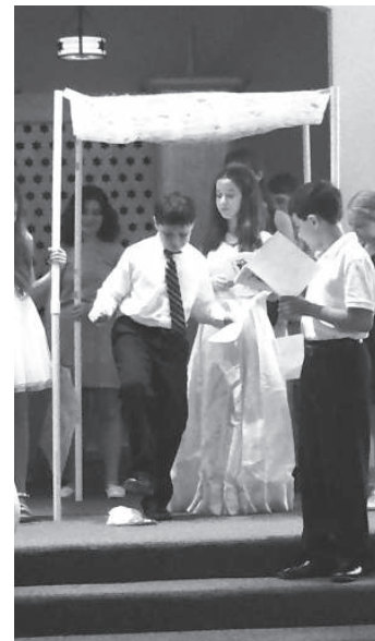
Breaking the Glass. MAZEL TOV!