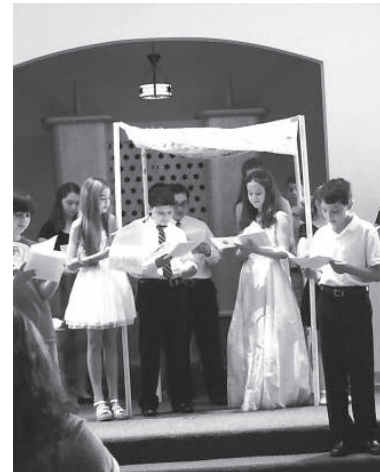
The solemn ceremony.