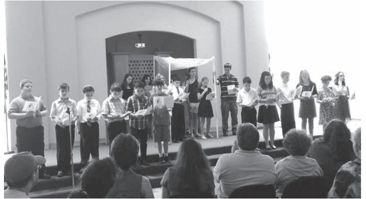
Waiting for the Bride.

Fifth Grade students in our Religious School held a beautiful mock wedding on Sunday, May 10. Students participated as Bride and Groom, Rabbi and wedding party. Parents, grandparents and siblings attended as well. The fifth grade curriculum includes learning about life cycle events, and the mock wedding is the perfect opportunity for participatory learning.