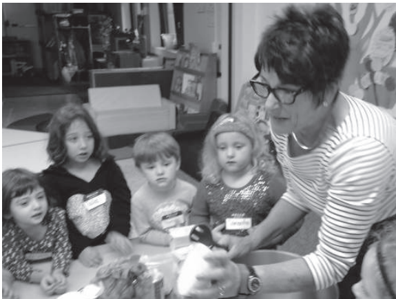
A fresh-cut onion can produce some interesting reactions.

1 head of cabbage (red or white) chopped 1 sweet onion, diced 6 baby carrots, sliced 3 Tbsp oil (I use grape-seed) 4 14.5-oz cans of diced tomatoes (flavored with garlic) 1 large box of chicken stock or broth 1/2 c chopped fresh parsley 6 basil leaves, chopped 2 bay leaves 2 Tbsp light brown sugar Salt and pepper to taste Heat oil and add onions. Cook until soft. Add cabbage and cook together for a couple of minutes. Add tomatoes, stock and rest of ingredients. Bring to a boil and then simmer for at least two hours. Note: It will taste even better the next day!