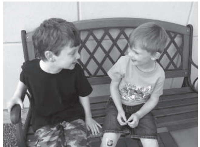
The Shalom Corner is the perfect spot for a shared laugh between PALS.