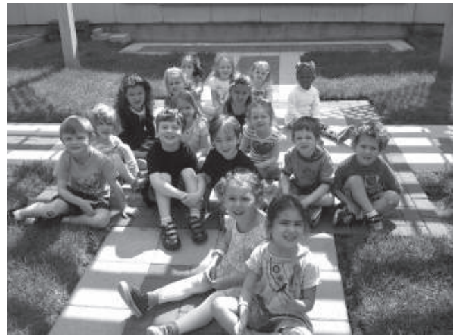
PALS all together in the shade of the gazebo.