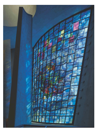
Windows by Ben Shahn at Temple Beth Zion, Courtesy of Chris Gascoigne, 2018